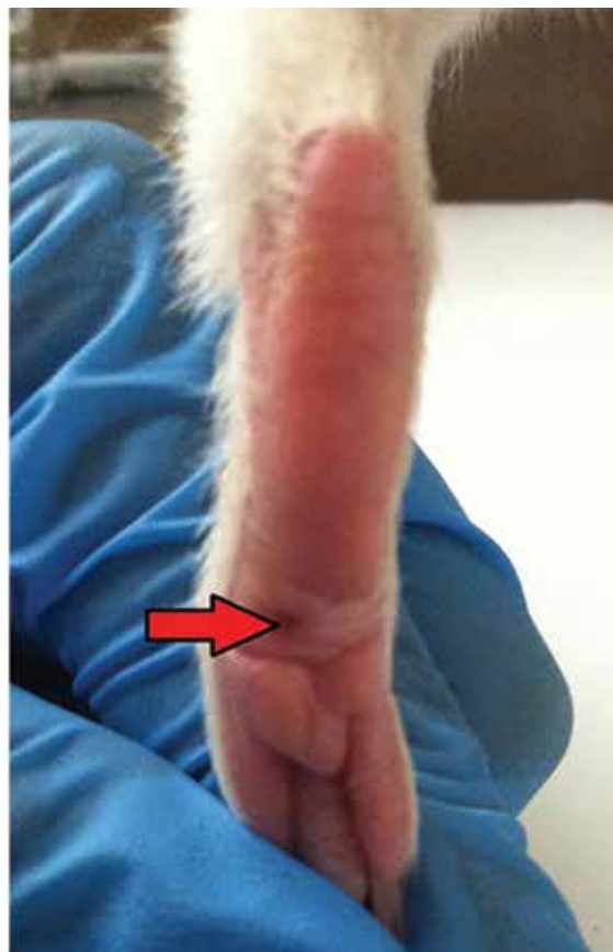
Figure 2. The site at which the algometer was applied on the left hindpaw.

correlation was used to determine whether plasma concentration correlated with PWP.